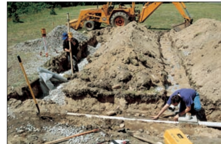
Typical Septic System Replacement Installation